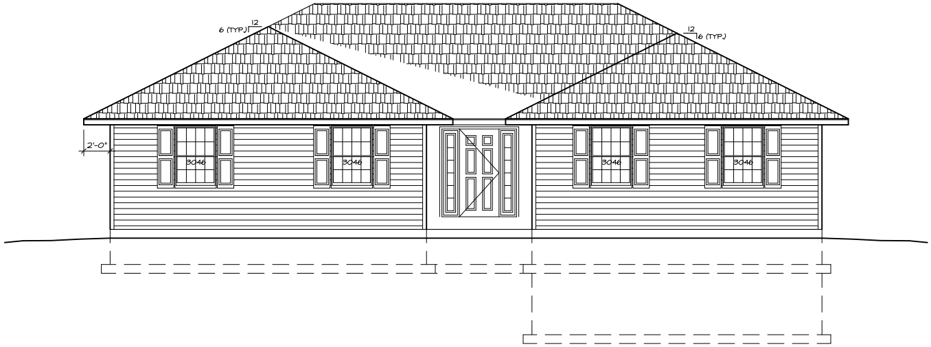
1 FRONT ELEVATION A-1